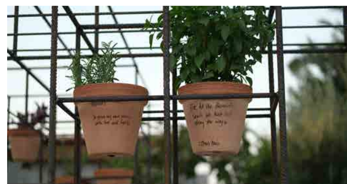
Creating a community herbal garden.

Partners: Urban Gorillas Location: Kaimakli neighbourhood, Nicosia Date: April-July 2022