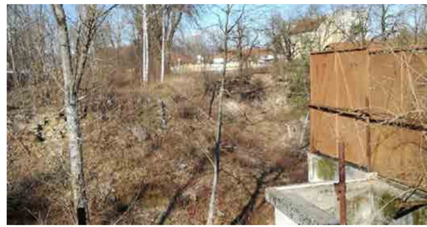
Natural surroundings to transform into a place