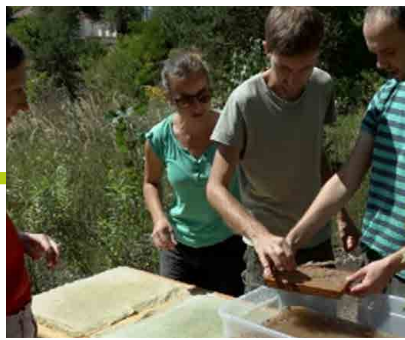
Preparing the table napkins for the community dinner using the invasive plants