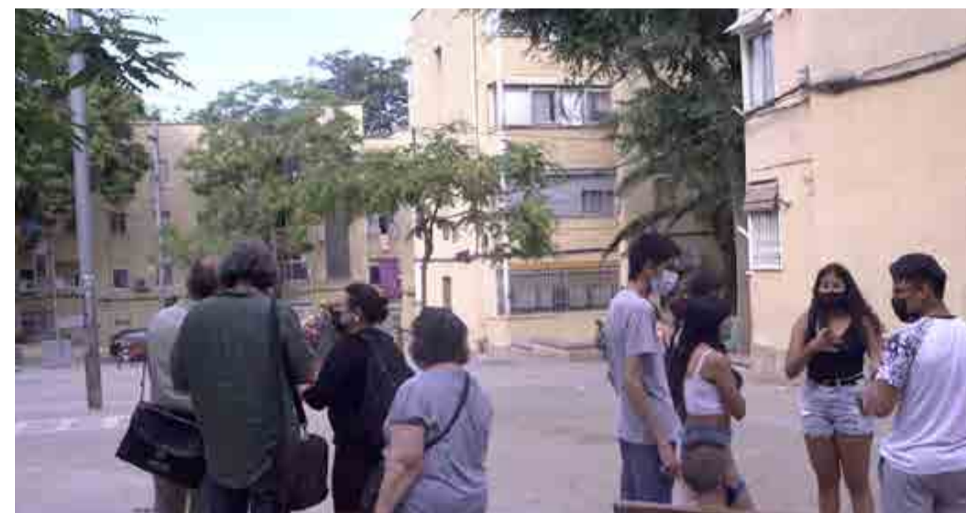
sense of belonging