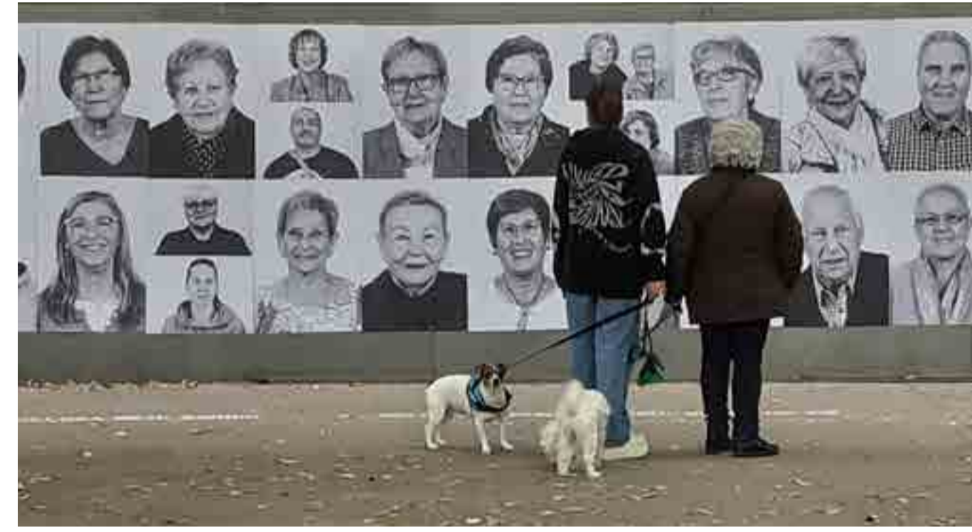
"The value of Bellvitge", by students from Institut Bellvitge (winner of an audience award)