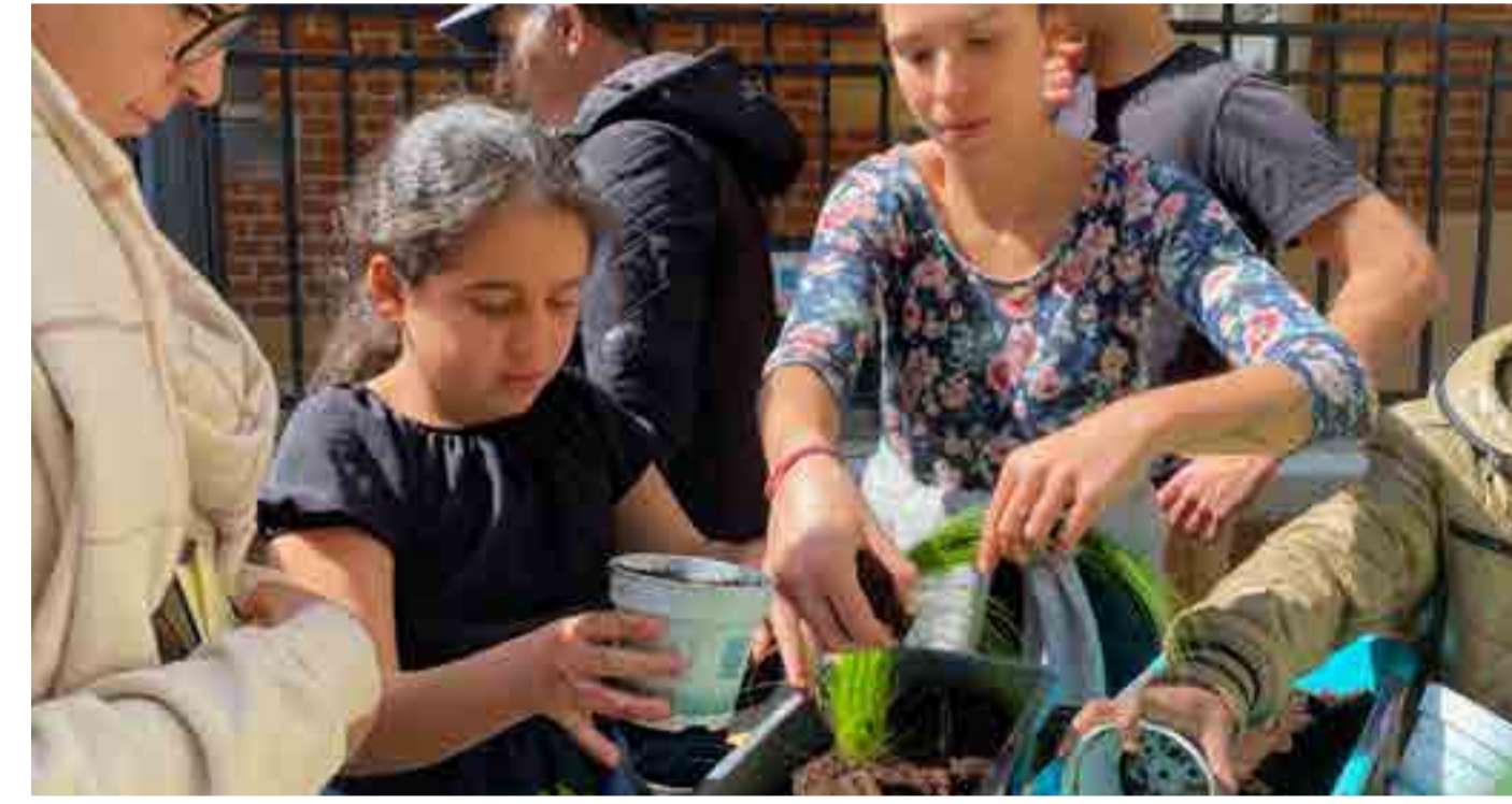
Planting plants with children from the neighbourhood.