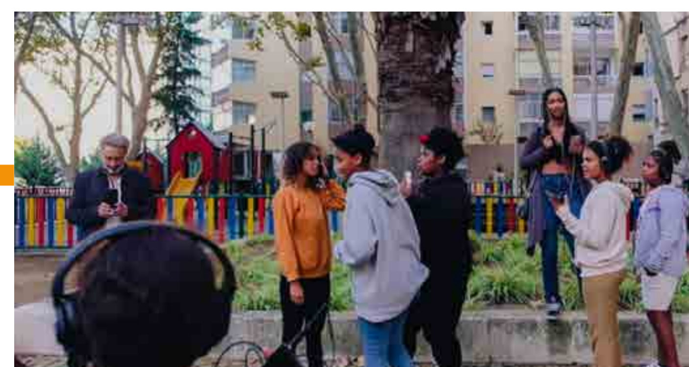
Recording the sounds of the neighbourhood

Partners: Universidade Nova de Lisboa Location: Rego neighbourhood, Lisbon Date: January-September 2022