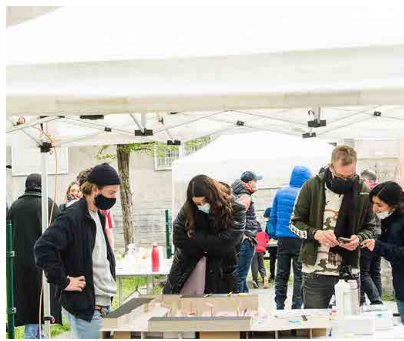
Setting up the participatory design process.