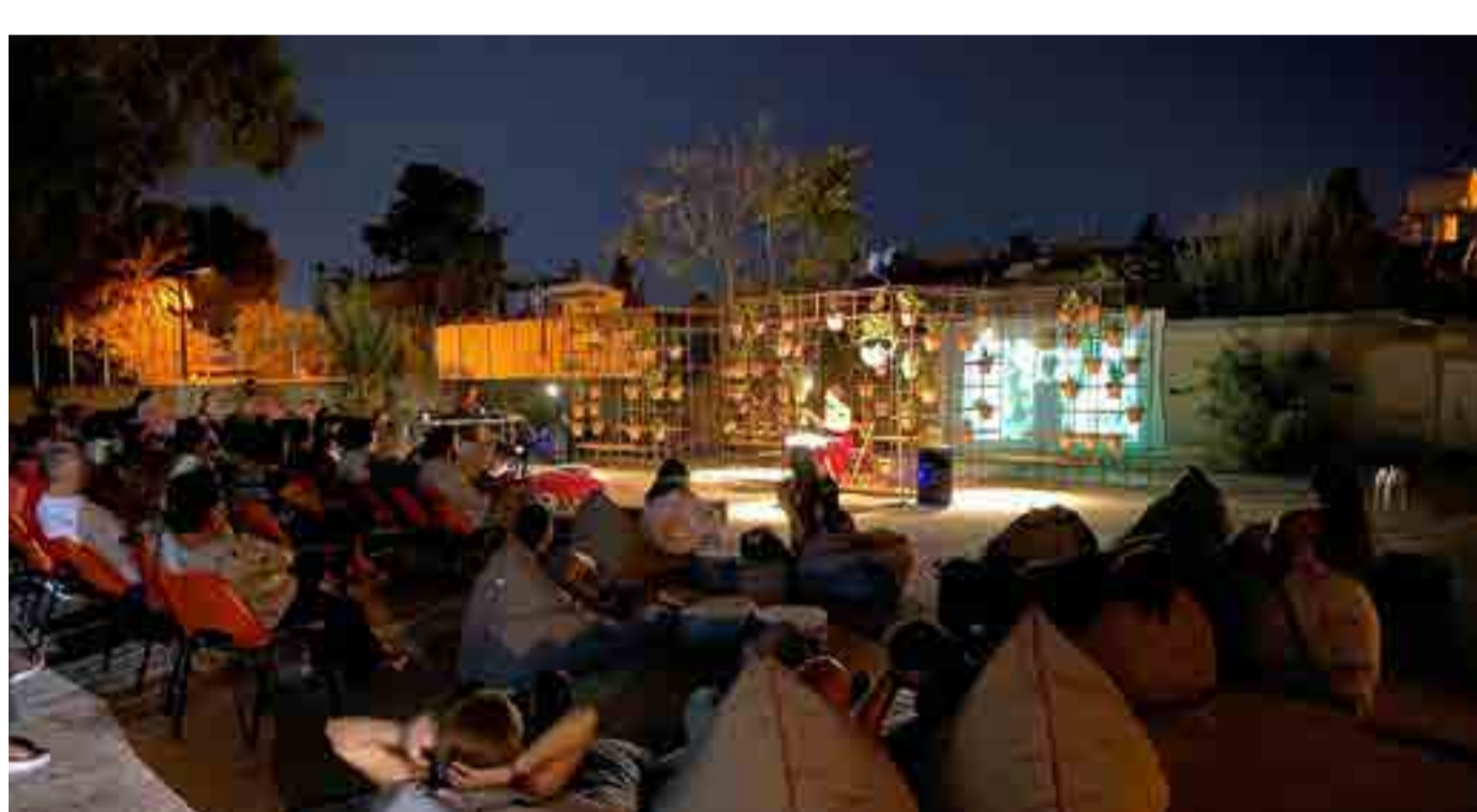
The Vertical Garden transformed the square into a vibrant place

Partners: Urban Gorillas Location: Kaimakli neighbourhood, Nicosia Date: July - September 2020