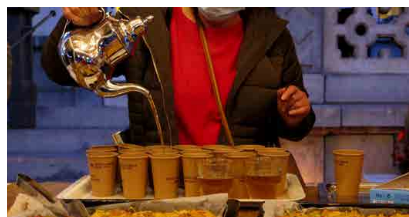
A community dinner with Turkish food.

Partners: Alive Architecture and KU Leuven Department of Architecture Location: Schaerbeek district, Brussels Date: October 2020