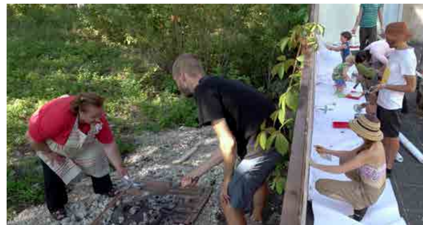
Looking for plants and painting the fence with local residents and young people