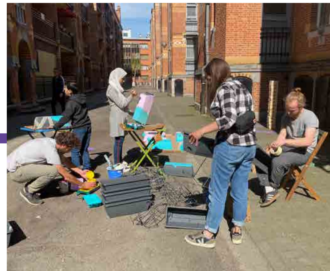
Painting balcony planters.

Partners: Alive Architecture, in collaboration with BRAVVO Location: Marolles neighbourhood, Brussels Date: April - June 2022