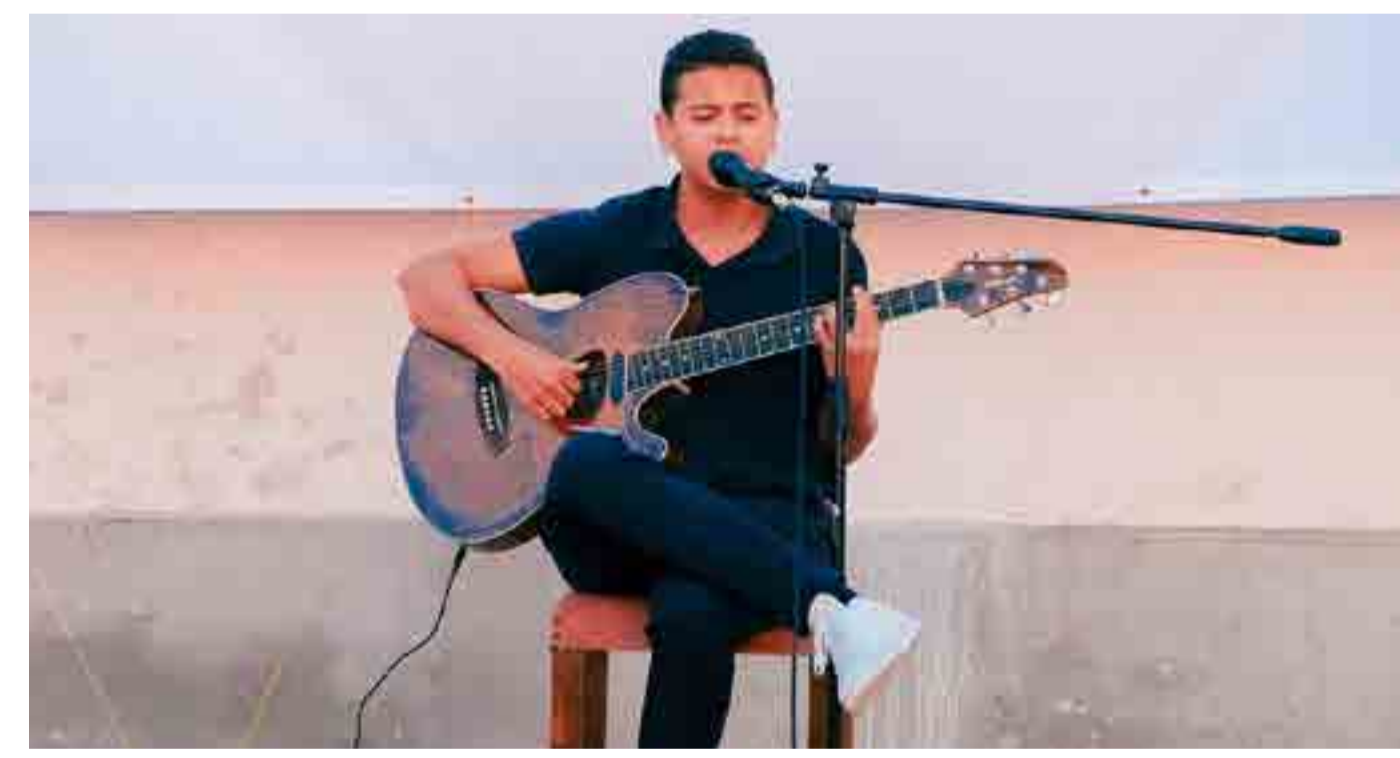
The sounds of fado resonated in the place