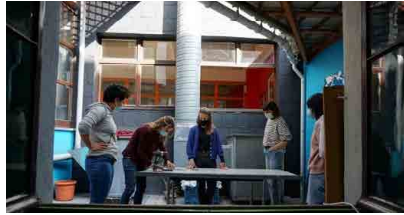
Students learning carpentry skills in the shelter