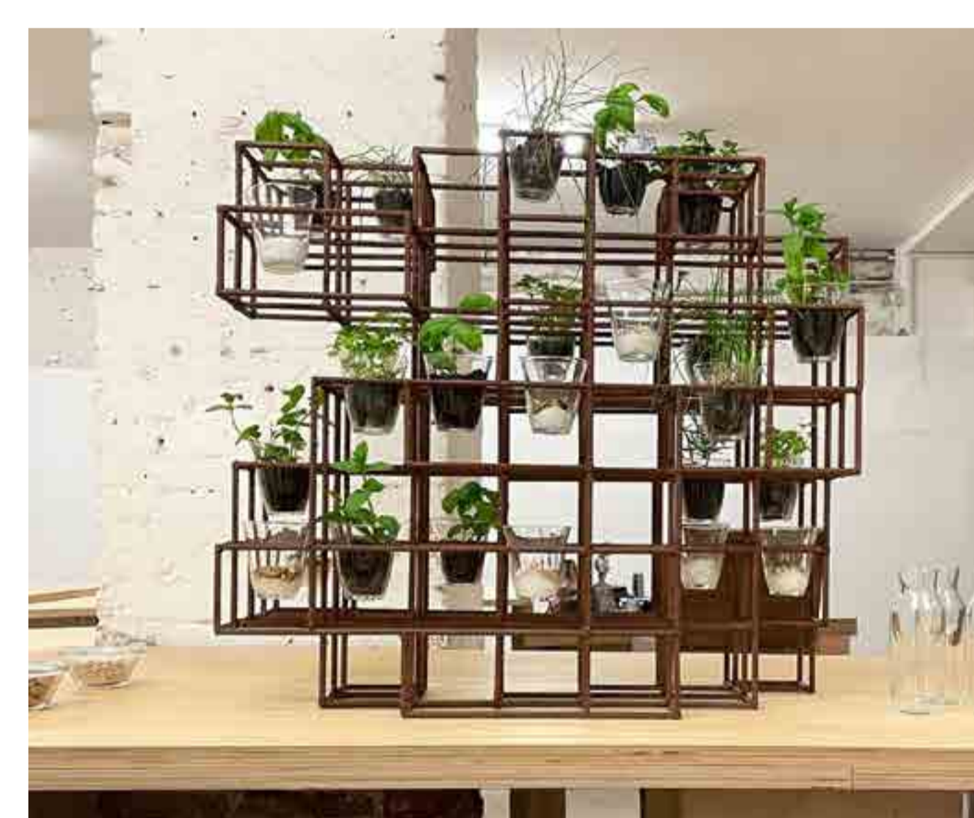
Installation at the Venice Biennale

Partners: Urban Gorillas, Alive Architecture, City Space Architecture and ProstoRož Location: Cyprus pavilion, Venice Biennale Date: October 2021