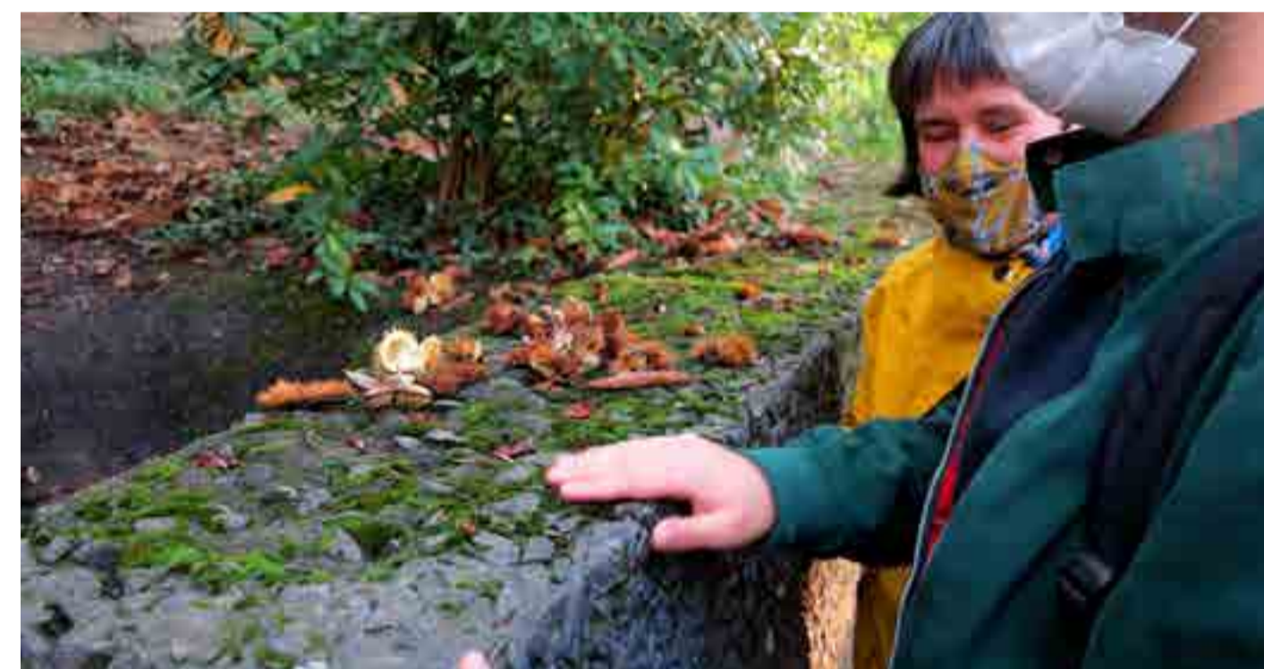
Reflecting on the experience of the sensory walk. Source: Alive Architecture