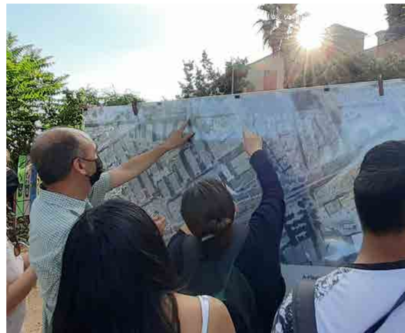
Taking a walk through La Florida district with residents of various ages and social groups

Partners: School of Architecture La Salle Location: La Florida neighbourhood, L'Hospitalet de Llobregat (Barcelona) Date: June 2021