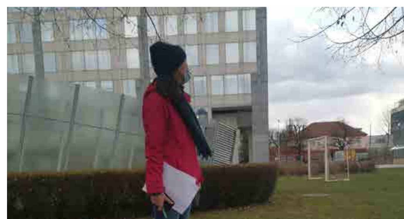
Taking students to explore the neighbourhood alleys