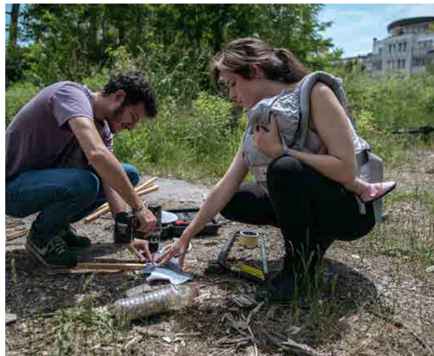
Building the proposal on the site