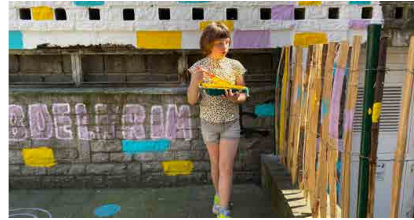
Children painting the freshly installed fence.