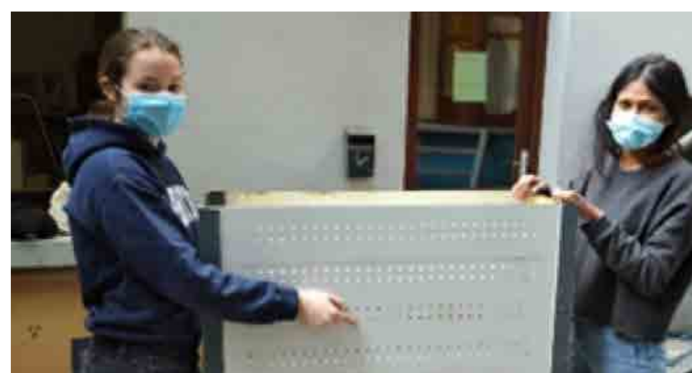
New furniture pieces assembled onsite

"Sense of place is what makes one city different from another, but sense of place is also what makes our physical surroundings worth caring about." Edward T. McMahon