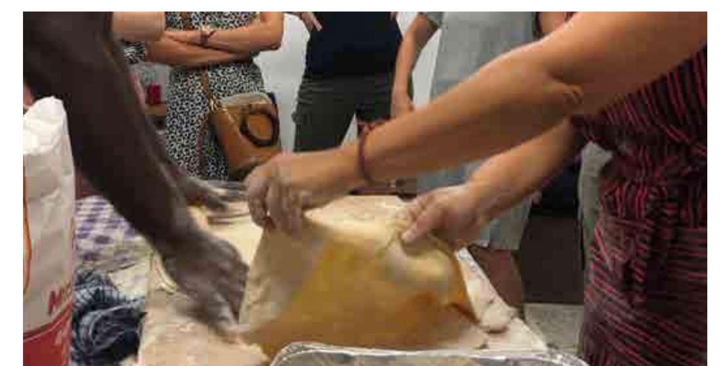
Tagliatelle-making workshop followed by dinner at the local cultural space Thalami.