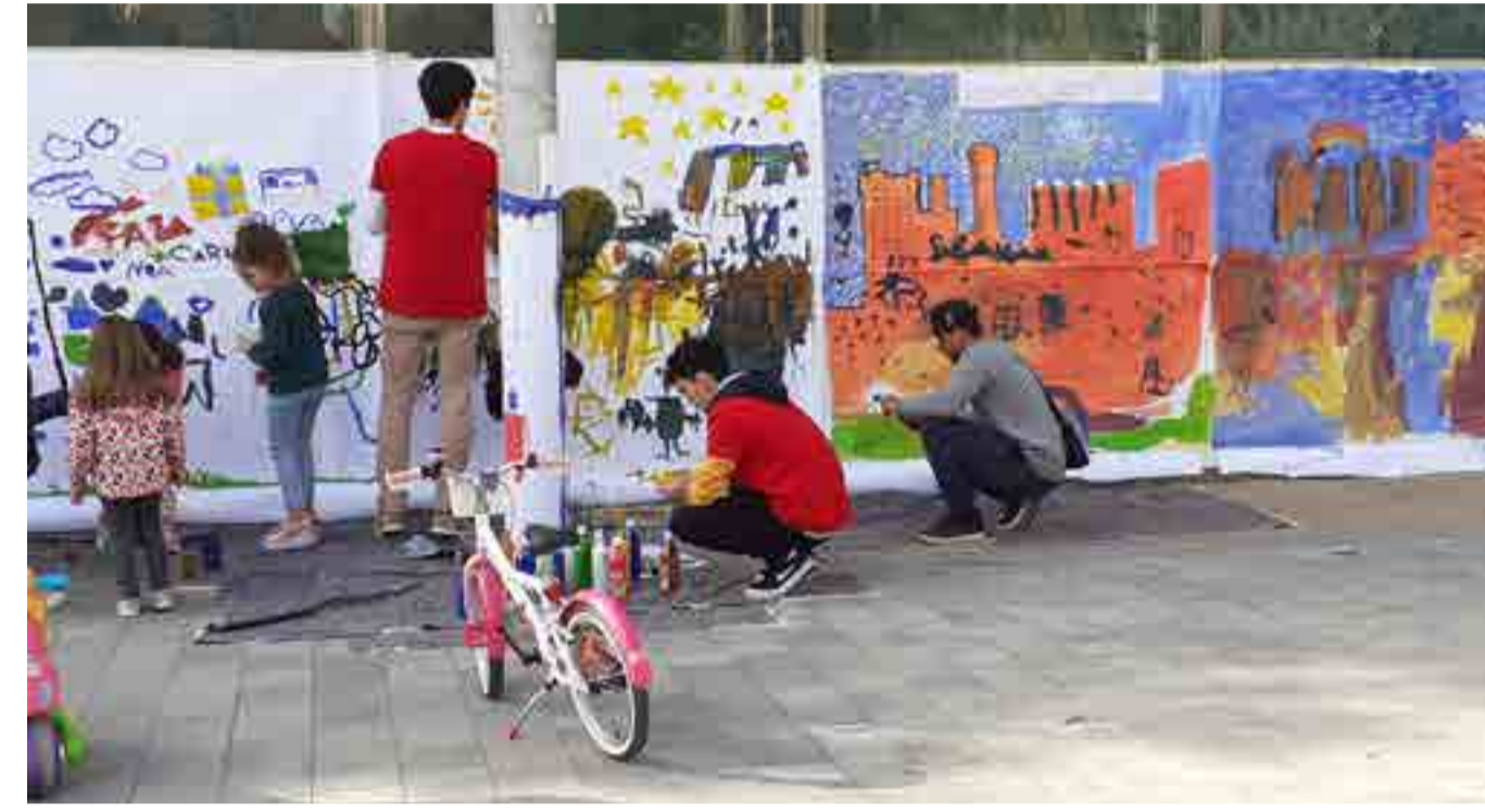
Painting and drawing workshop for children organized by PlayART