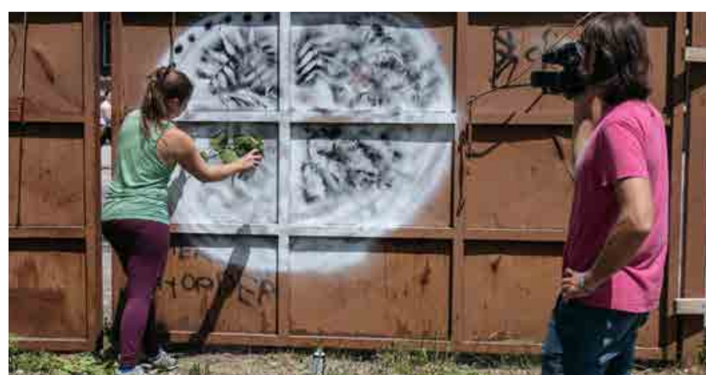
Painting the fence on-site

Partners: Faculty of Architecture, University of Ljubljana and Prostorož Location: "Krater" area, Bežigranski Dvor, Ljubljana Date: March - June 2020