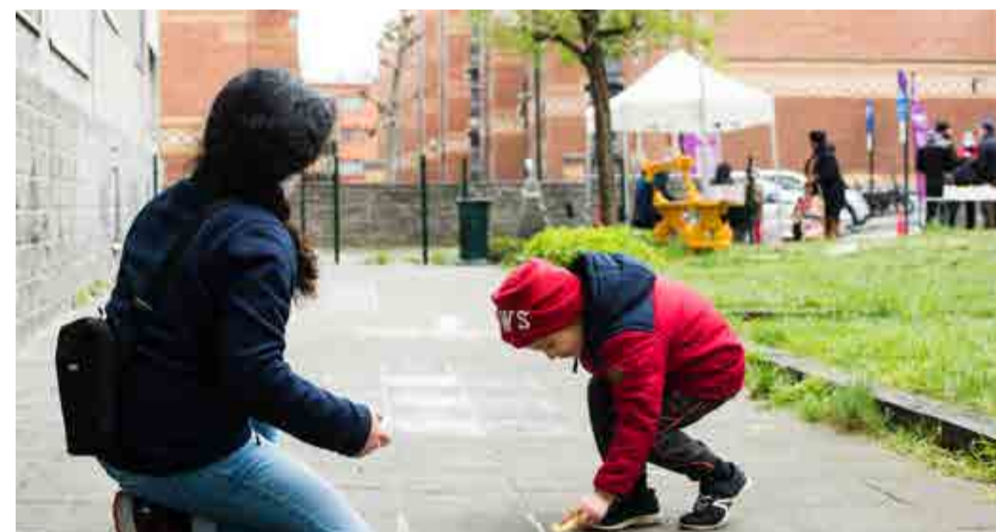
Designing on the site with residents.