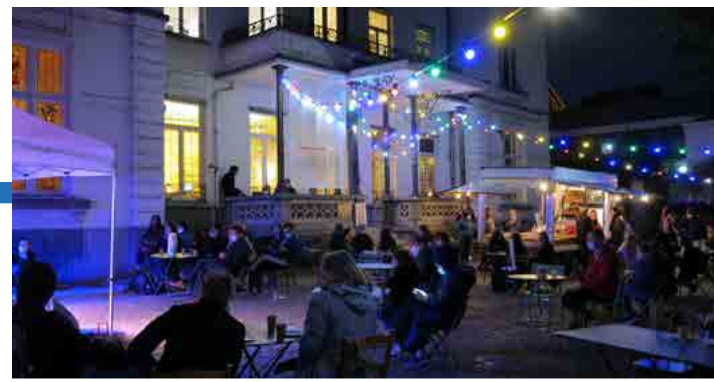
Courtyard of Maison des Arts during the dinner and concert.