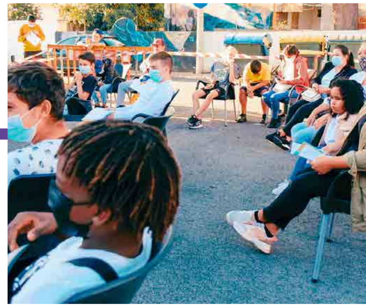
Award ceremony at the Amigos da Luz association