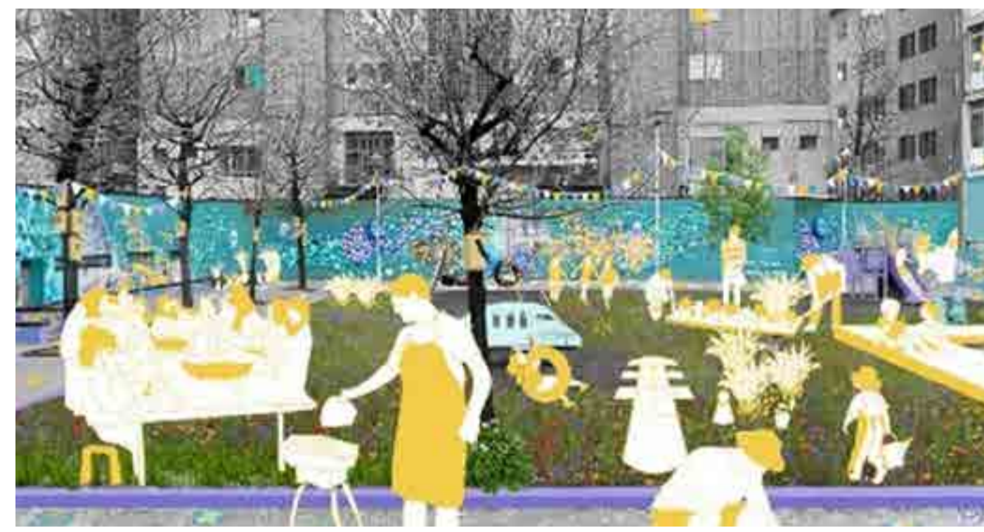
Transforming Pieremans playground into a lived space.