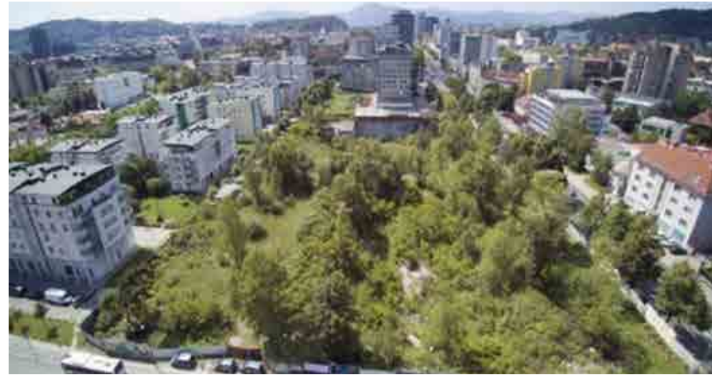
A hidden place: Bežigranski Dvor, Ljubljana