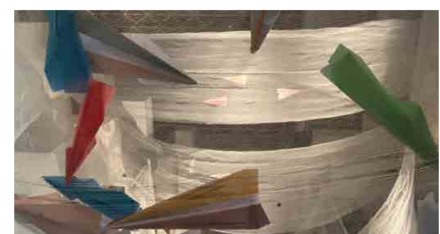
Installation at City Plaza, Nicosia. Wishes written in origami pieces

Partners: Urban Gorillas Location: City Plaza, Nicosia Date: October-December 2021