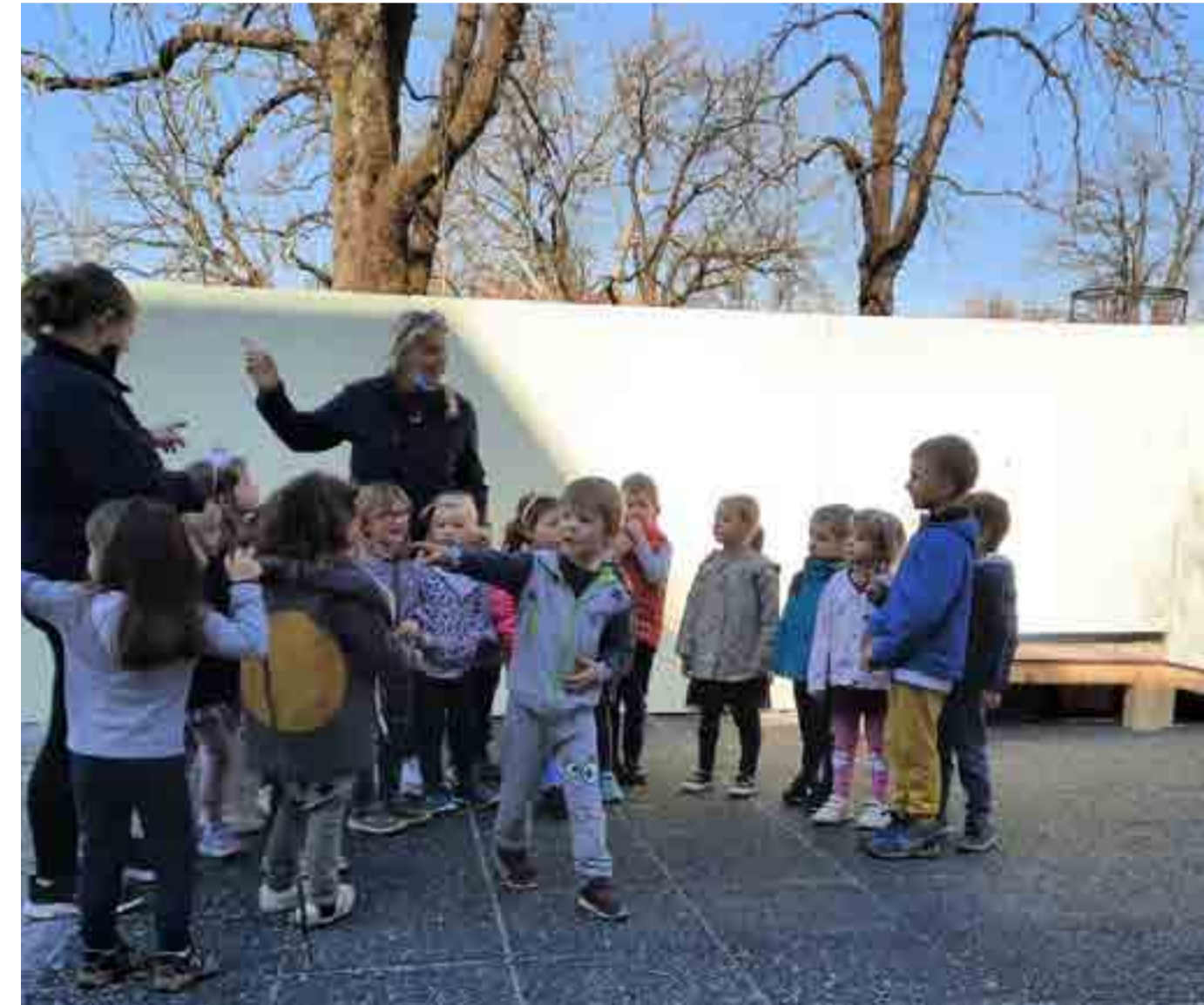
Observing the behaviour and play of children