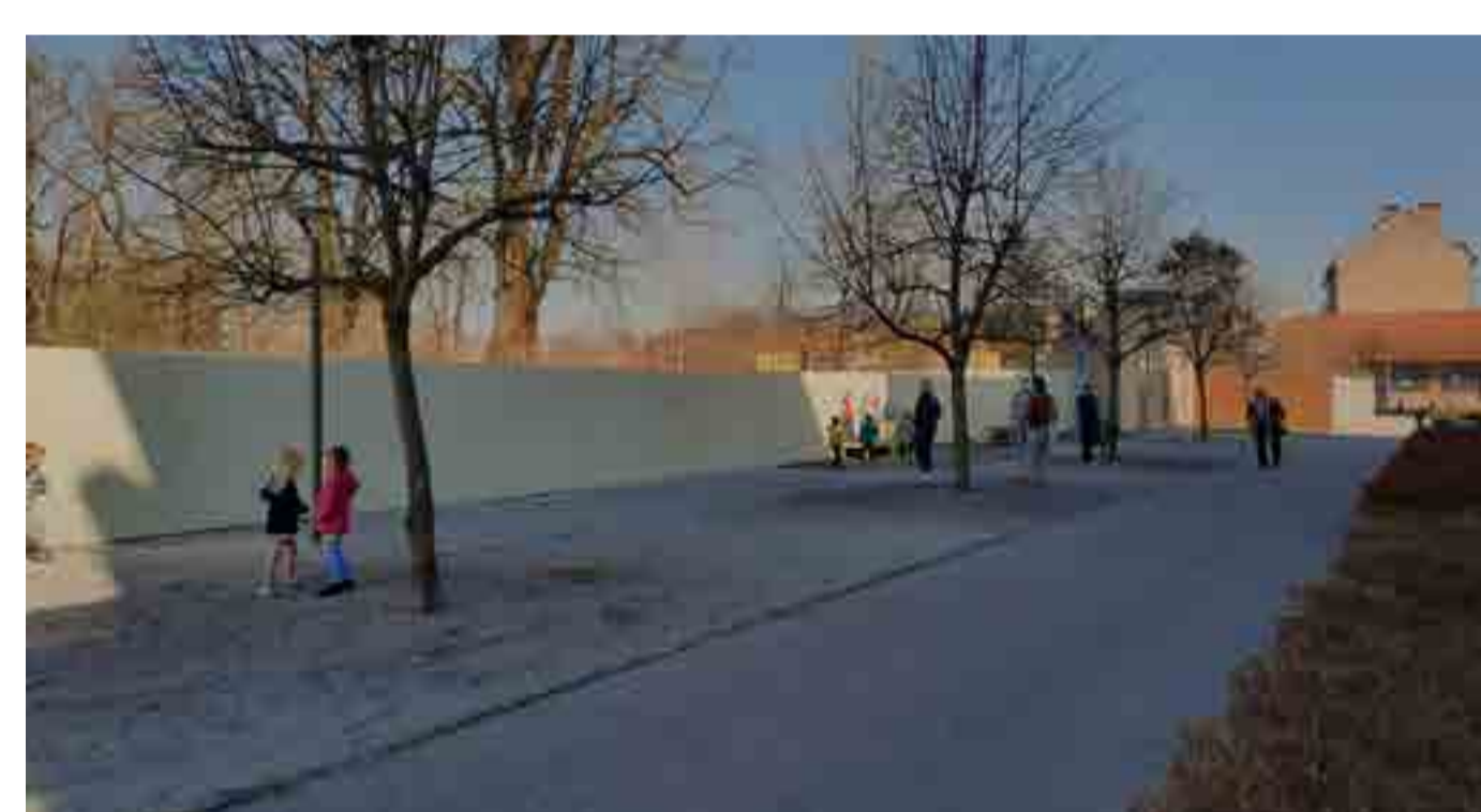
Taking students to explore the neighbourhood alleys

Partners: Faculty of Architecture, University of Ljubljana and Prostorož Location: Bežigranski Dvor district, Ljubljana Date: March - May 2021