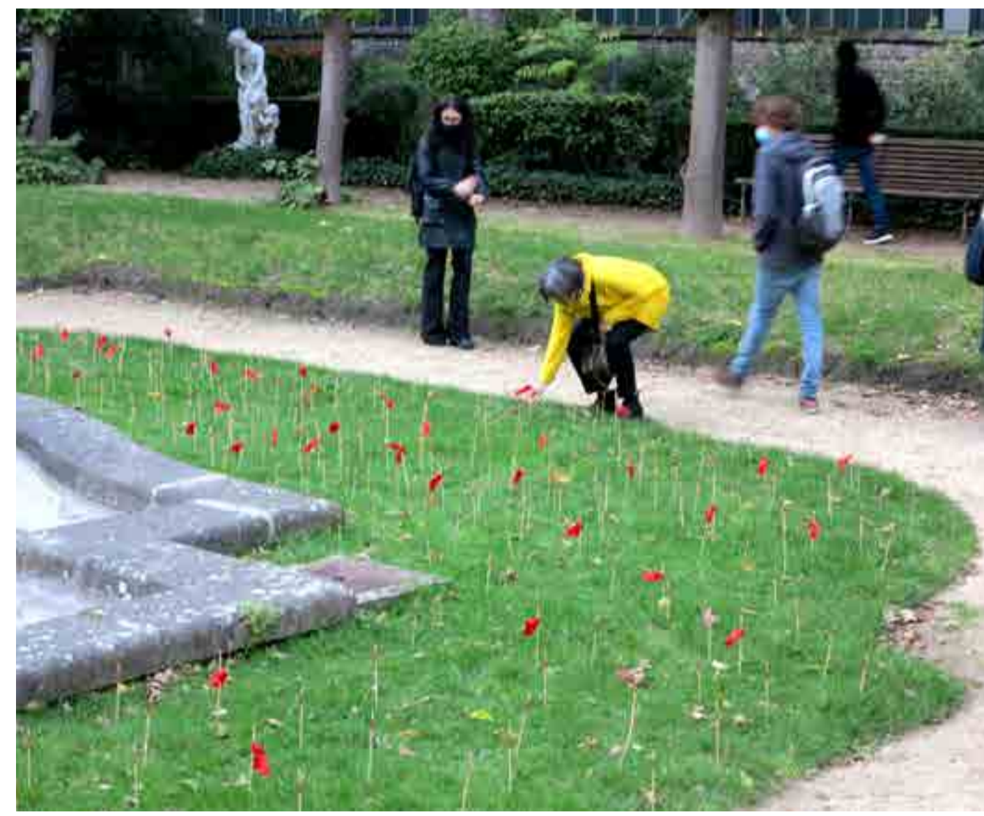
After the walk, leaving traces of the reflections.