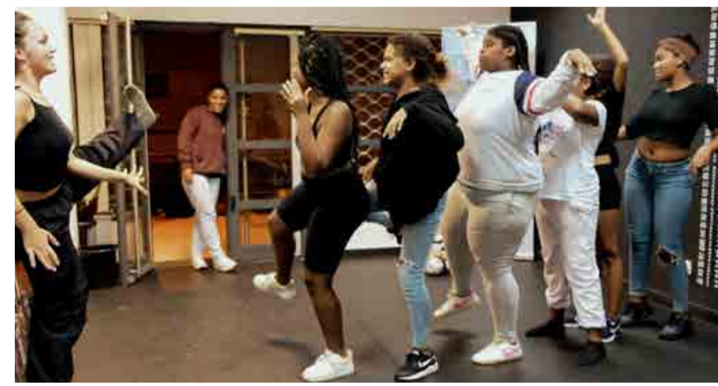
Co-creating a choreography to perform a flash mob