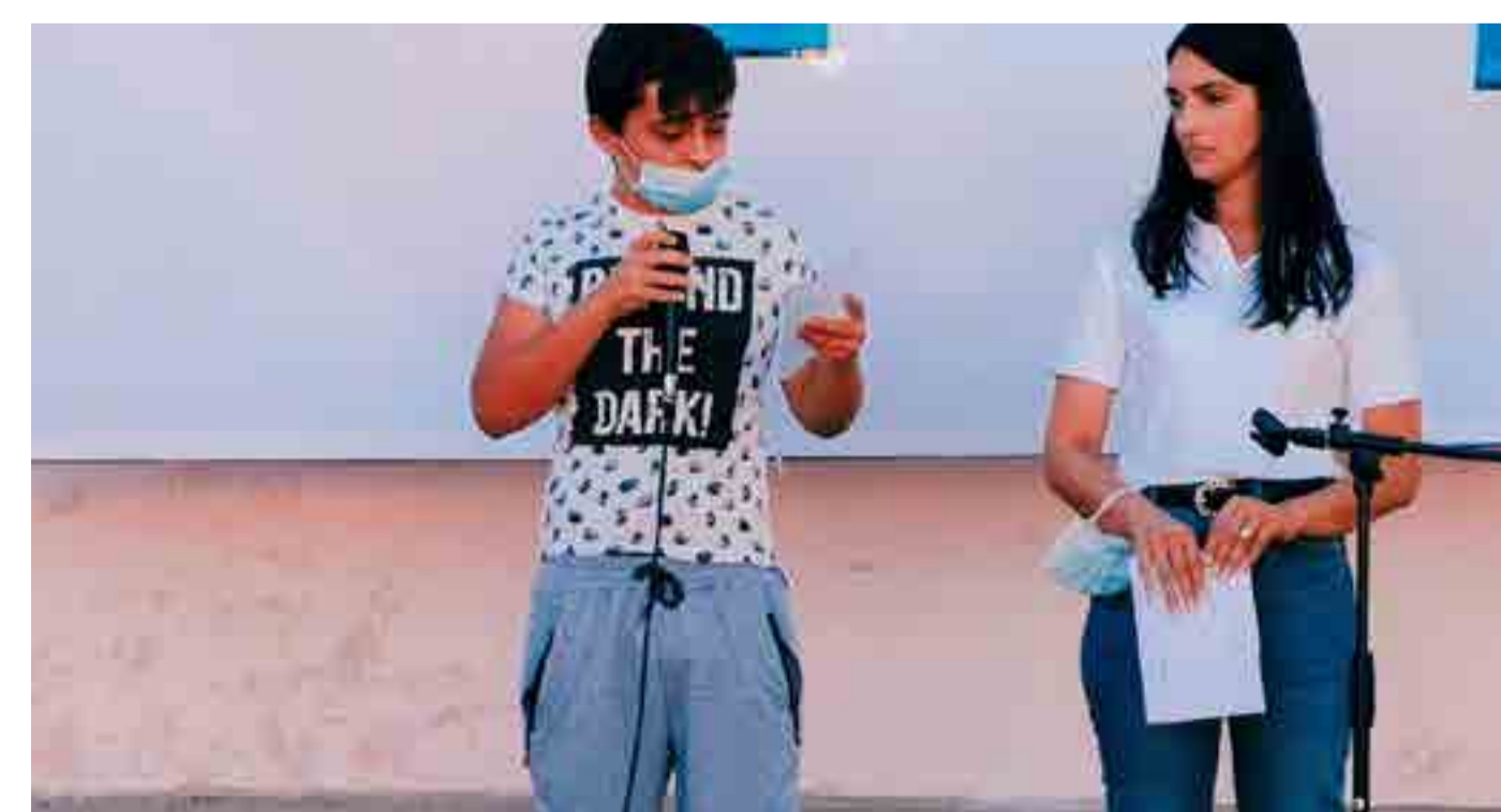
Reading of the awarded texts by winners

"I always said and proudly I'm from the neighbourhood, Yes sir! I was raised with respect In the neighbourhood, we felt love We had the time for everything Studying, working, living together. We had great fun In moments of leisure we decorated the streets and jumped over the fire we burned artichokes we played well There were three associations it's sad because they ended I congratulate you for the project you started The history of our neighbourhood that was told in a book I advise you to read it a lot has been changed"