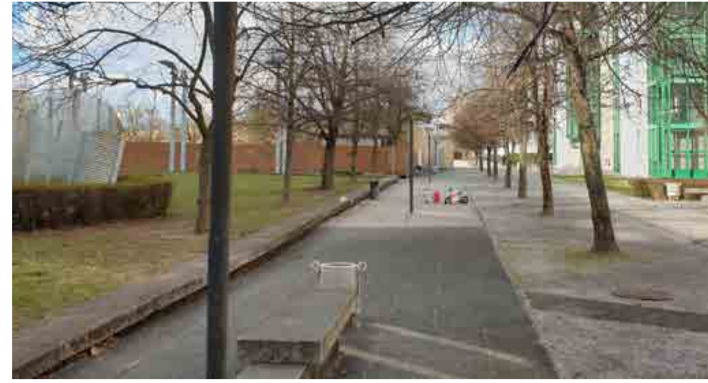
Taking students to explore the neighbourhood alleys