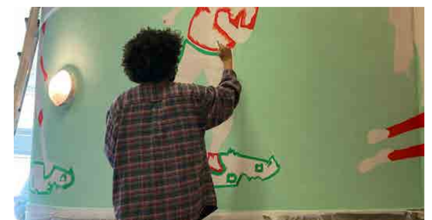
Students and residents infusing vitality in the shelter

Partners: KU Leuven Department of Architecture Location: Bodegem Foyer shelter, Brussels Date: November 2021