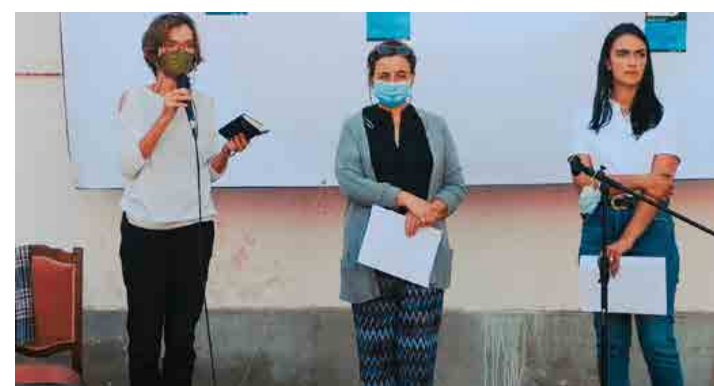
Jury members announcing the winners