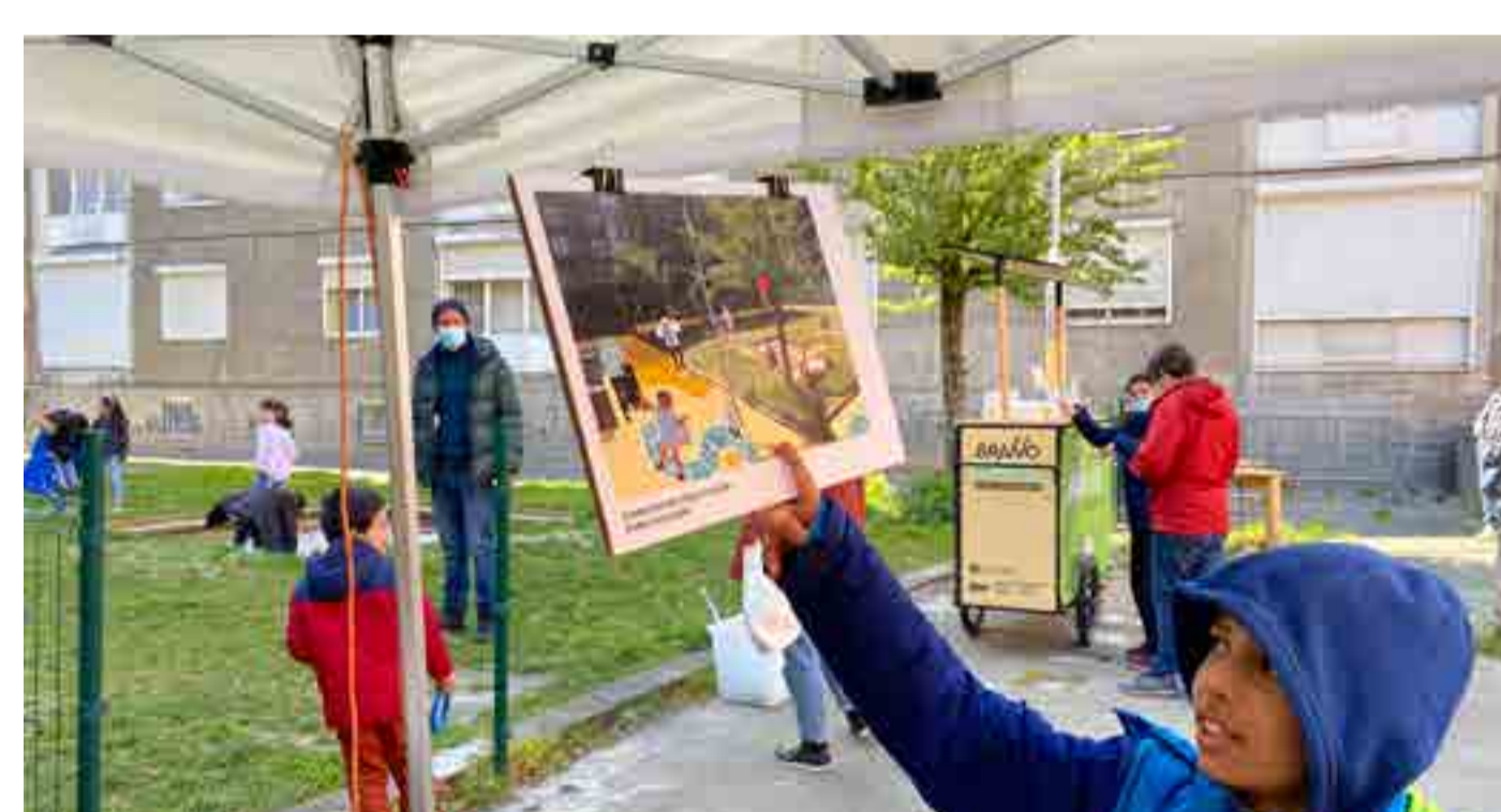
Discussing the proposals in the place.

Partners: Alive Architecture, in collaboration with BRAVVO Location: Marolles neighbourhood, Brussels Date: April - June 2021